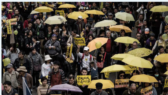
Occupy Central with Love and Peace is a civil disobedience movement that began in Hong Kong in September 2014. It called on protesters to block roads and paralyse Hong Kong's financial district if the Beijing and Hong Kong governments did not agree to implement universal suffrage for the chief executive election in 2017 and the Legislative Council elections in 2020