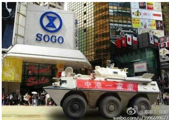
Pro-Beijing protests in Hong Kong: the red banner on the tank reads ‘China and Hong Kong are One Family’

— the ‘Chinese Mafia’) have been cultivated by the UFWD largely because of their assumed influence on the wider population. Such allies may in turn benefit from their links to the Communist Party, and believe it will protect their interests. But the growing number of protests show that the United Front message is failing to resonate with many ordinary people in these places and elsewhere across China, undermining Xi Jinping’s vision of a Shared Destiny. The lessons of twenty-five years ago though, warn us that that the Party has other ways of realising such ideals as ‘China and Hong Kong are One Family’ 中港一家亲.