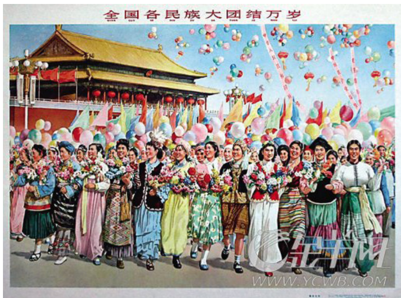
'Long Live the Unity of all the People of the Nation': ethnic minorities pictured in Tiananmen Square. Yang Junsheng, 1957 Source: ycwb.com

Many of them belonged to or were influenced by the so-called democratic parties 民主党派. This 'New Democratic, Anti-Imperialist Anti-Feudal United Front' became a key to the Party's success in undermining, isolating and de-legitimising the Nationalists. The common goals of national triumph over Japan and a better future had powerful appeal. No wonder then, that after achieving victory in 1949, Mao Zedong declared United Front work one of the Party's three great secret weapons, alongside party-building and its armed forces.