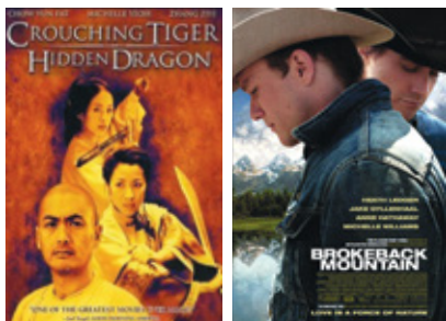
Ang Lee's acclaimed films: Crouching Tiger, Hidden Dragon (2000); Brokeback Mountain (2005).

Lee's unyielding commitment to realising his dreams 'should be copied by other professionals'. Speaking more specifically to the film industry, the PRC State Council Office for Taiwan Affairs said that 'Ang Lee is a model for the entire Chinese film industry, not just on the Mainland'.