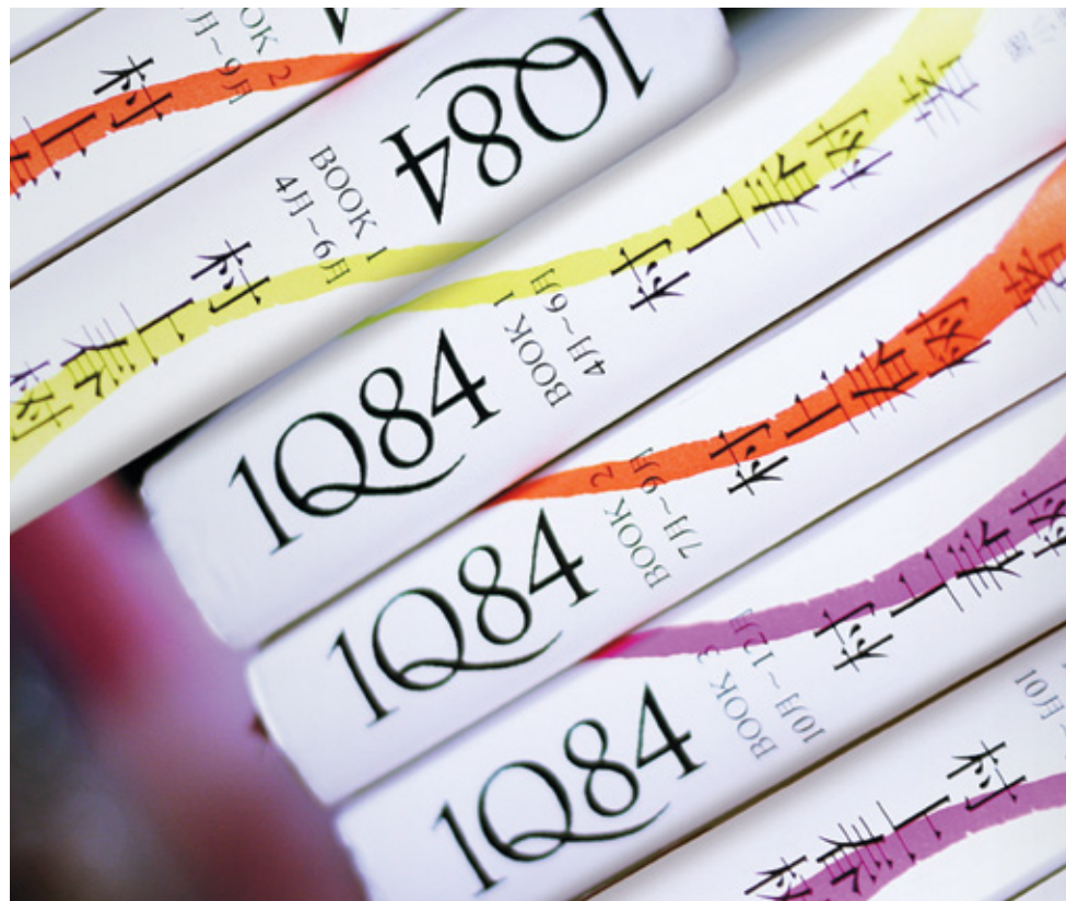
A Chinese version of Haruki Murakami's work 1Q84 .