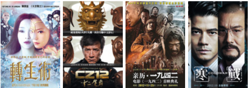
Film posters of top domestic films: Painted Skin: The Resurrection ; CZ12 ; Back to 1942 ; Cold War .

The following list published in Huaxi Metropolitan Daily (Huaxi dushibao 华西都市报) is based on book sales figures in China: