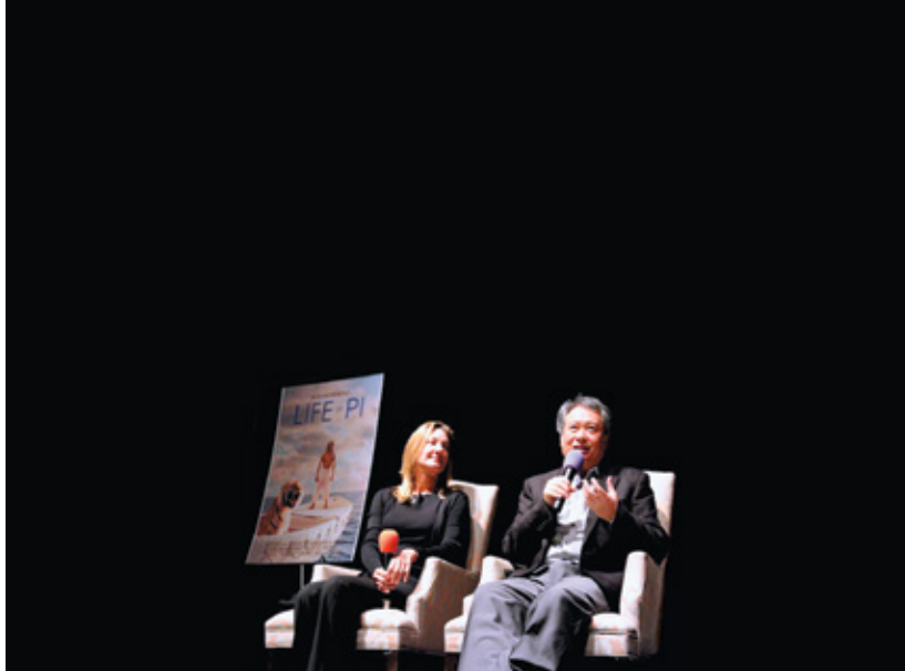
Ang Lee introducing Life of Pi at the 35th Mill Valley Film Festival.

the same problem but use a different tone. For example, an editorial in the Guangming Daily asked whether Lee's Oscar should be a cause for joy or a cause for concern. It concluded by emphasising that Life of Pi was a success for Lee himself as well for American cinema, but not for the Chinese film industry, neither on the Mainland nor in Taiwan.