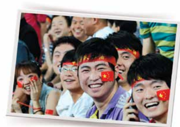
Chinese football fans, Guiyang, June 2011.

As China becomes wealthier and more confident on the global stage, it also expects to be respected and accommodated as a major global force — and as a formidable civilisation. Through a survey and analysis of China's regional posture, urban change, social activism and law, mores, the Internet, history and thought — in which the concept of 'civilising' plays a prominent role — China Story Yearbook 2013 offers insights into the country today and its dreams for the future.