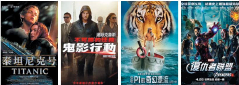
Film posters of the top four foreign films in 2012: Titanic ; Mission Impossible ; Life of Pi ; The Avengers .