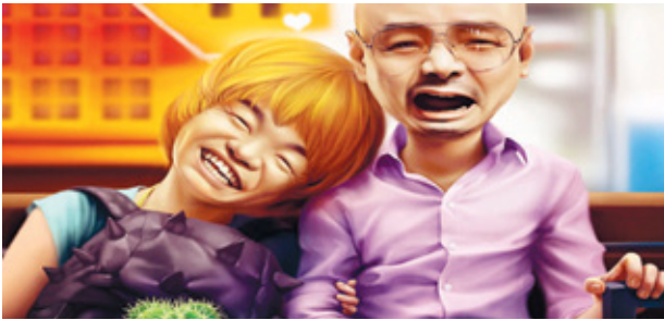
Scene from the domestic blockbuster Lost in Thailand .