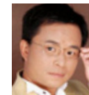
Murong Xuecun.

Hao Qun, winner of the 2010 People's Literature Prize (Renmin wenxue jiang 人民文学奖), is the author of five novels that explore government corruption and popular disillusionment written under the pen name Murong Xuecun. He once claimed a total of 8.5 million followers of his four microblog accounts, hosted respectively on Sina, Tencent, Netease and Sohu. On 11 May 2013, all four accounts suddenly disappeared. No official explanation was given.