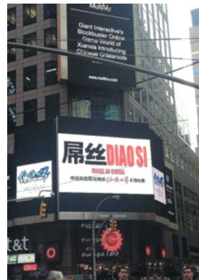
Billboard on Times Square for fantasy game, stating 'Diaosi, Made in China' in April 2013.

Literally 'penis thread', diaosi is a self-deprecating epithet used by men who, sarcastically or otherwise, perceive themselves as losers in society. In a world in which marriage is all too frequently like a commercial transaction, a diaosi might possess the traditional virtues of reliability, industry and loyalty, but lack the requisites for social success in today's China: wealth, power and good looks. He's thus a diaosi — a loser unable to win the hand, for example, of a desirably pale, rich and pretty ( bai fu mei 白富美), if icy, goddess.