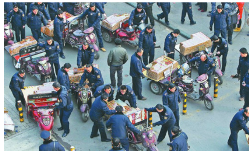
Xinjiang qiegao on tricycles with Uyghur sellers in December 2012.

stroyed goods: 160,000 yuan. The size of the compensation turned qiegao into Internet joke fodder: 'Dear Gandie ,' reads one, 'if you love me, don't give me a Maserati or Louis Vuitton bags; I just want a piece of qiegao .'