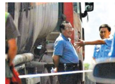
Yang Dacai, smiling, at the site of the tragic collision where thirty-six people lost their lives.

Yang Dacai, a safety official in Shaanxi province, became the object of public ire when he was photographed with a smirk on his face at the scene of a deadly multi-car accident in Yan'an on 26 August 2012, an incident later dubbed 'Smile-gate' ( weixiaomen 微笑门). Angry Internet users scoured the net for additional incriminating evidence and turned up a variety of photographs in which Yang was wearing different pricey foreign watches. A subsequent investigation revealed that he owned eighty-three watches and had more than sixteen million yuan in cash and bank deposits that couldn't legally be accounted for. Yang was removed from his posts on 21 September and dismissed from the Party on 22 February 2013, after which his case was turned over to the criminal justice system.