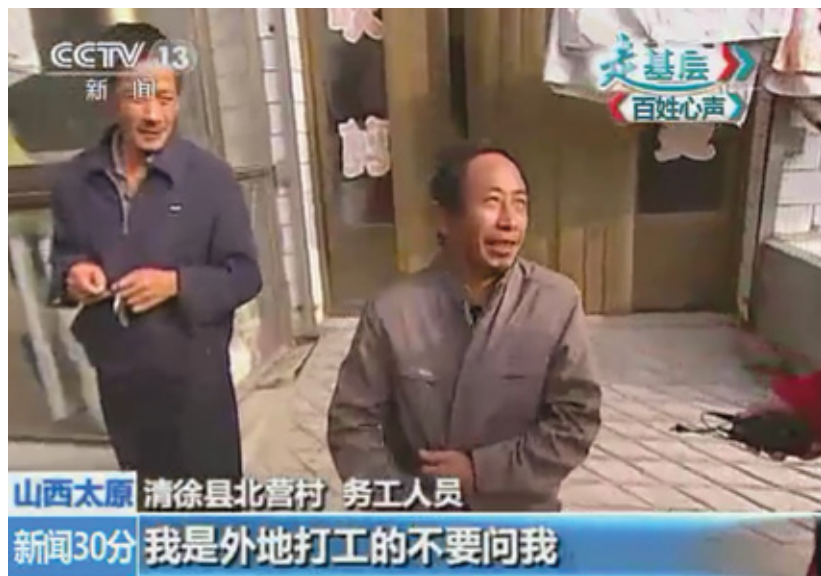
Prompted by the question 'Are You Happy?' the man replies 'Don't ask me, I'm an itinerant labourer.'

Beginning in October 2012, the state broadcaster China Central Television sent its reporters into the streets to ask people across the country if they were happy. Their answers, some of them unexpectedly hilarious, aired on the nightly newscast and became a running meme that was referenced in the 2013 Spring Festival Gala.