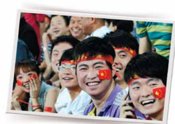
Chinese football fans, Guiyang, June 2011.

A s China becomes wealthier and more confident on the global stage, it also expects to be respected and accommodated as a major global force — and as a formidable civilisation. Through a survey and analysis of China's regional posture, urban change, social activism and law, mores, the Internet, history and thought — in which the concept of 'civilising' plays a prominent role — China Story Yearbook 2013 offers insights into the country today and its dreams for the future.