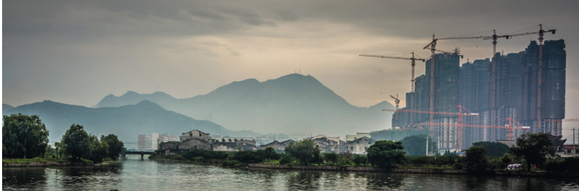
Worlds collide: Downtown Wenzhou, Zhejiang province, on the right, and surrounding village, photographed on 15 June 2013.

use rights, welfare, financial support and fiscal regimes. It has also been suggested that such ‘bottom up’ development of larger farms will counter the increasing penetration of agribusiness into the Chinese countryside, which public opinion sees as one of the reasons for the increase in food security issues.