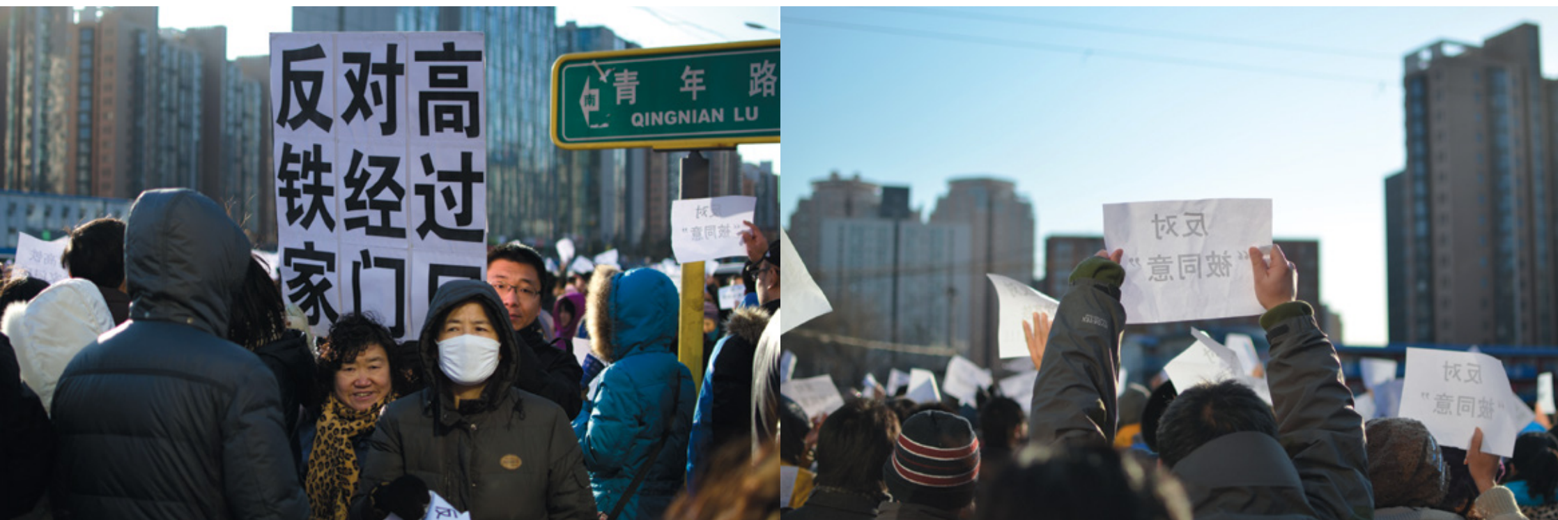
Beijing residents protest against high-speed railway construction.

A chemical plant in Dalian, Liaoning province, is closed down after thousands of protesters confront riot police, demanding that the plant be shut due to safety concerns.