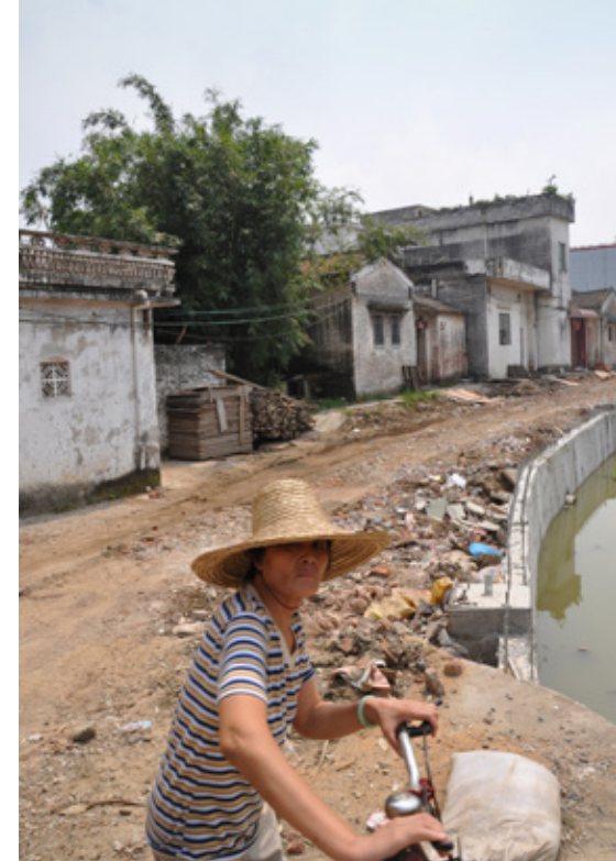
A Guangdong village.

From 2010, a third land reform has been on the cards and, while discussions rage, local experiments flourish. Since 2003, the Party has produced an annual 'Document No.1' ( Yihao wenjian 一号文件) devoted to rural reform and the solution of the so-called 'three rural problems (or issues)' ( sannong wenti 三农问题: agriculture, rural areas and peasants). In 2013, the document that set the tone for rural policy during the year focused on three aspects of this reform: the encouragement of 'specialised farming households' ( zhuanye nonghu 专业农户); the expansion of rural co-operatives through the corporatisation of collective land in the hands of shareholding companies, inspired by the experiments with corporate collective land first in Guangdong and more recently in other rapidly industrialising areas of the country; and, thirdly, the establishment of 'family farms' ( jiating nongchang 家庭农场). 'Family farms'