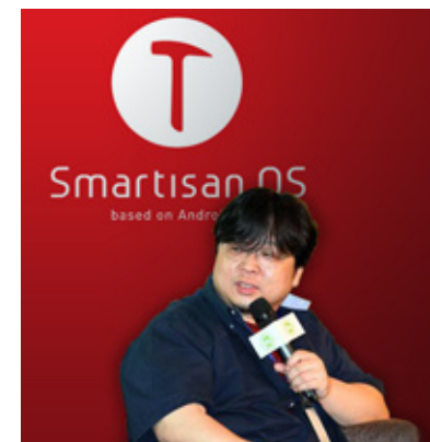
Luo Yonghao.

In early 2011, the Internet celebrity and noted teacher Luo Yonghao tried attracting the attention of Siemens via his Weibo microblog when the door of his fridge refused to shut. When the company ignored him, Luo got other angry customers to join him in smashing their fridges outside Siemens' Beijing headquarters.