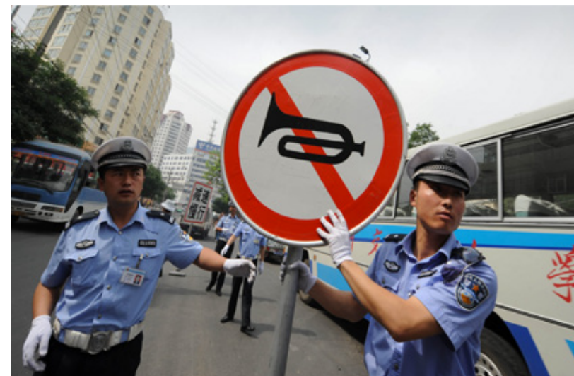
Traffic police in Gansu province.

Genetically modified food a focal point.