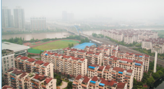
Housing complex in Ningbo, Zhejiang province.