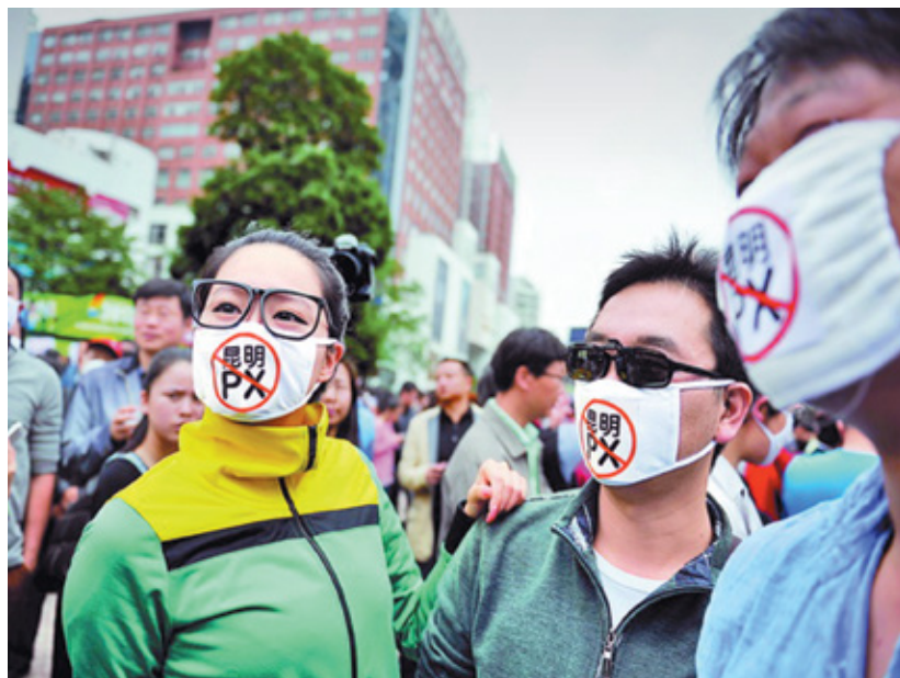
NIMBY protesters wearing facemasks during a protest against a PX plant in Kunming.

Hundreds of people gather in Kunming, Yunnan province, to protest plans to build a PX plant in a nearby town.