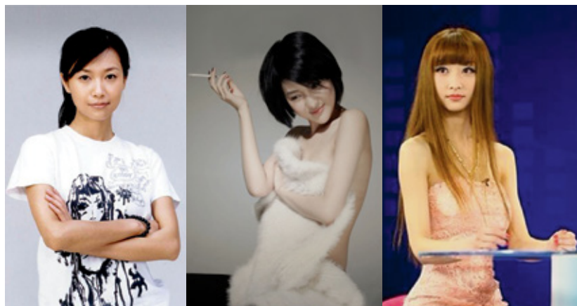
Xu Jinglei.