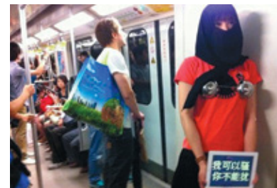
A female protester holding a placard reading ‘I may be flirtatious, but you shouldn’t harass me’.

In June, an official working on the Shanghai subway posted an image on Weibo showing the back of a woman wearing a see-through top. Professing his good intentions, the official reminded women not to invite sexual harassment by dressing provocatively. A few days later, two women launched a protest by carrying posters in the subway with the words ‘I may be flirtatious, but you shouldn’t harass me’ ( Wo keyi sao, ni buneng rao 我可以骚，你不能扰), saying that they had the right to dress in revealing clothes without the threat of being harassed or abused on the subway or, for that matter, anywhere else.