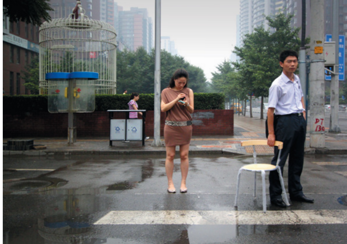
Giant bird cage.

Then there's the campaign against leftover women! In 2007, the Women's Federation defined the new term, shengnü 剩女 or 'leftover women'. The Ministry of Education adopt-