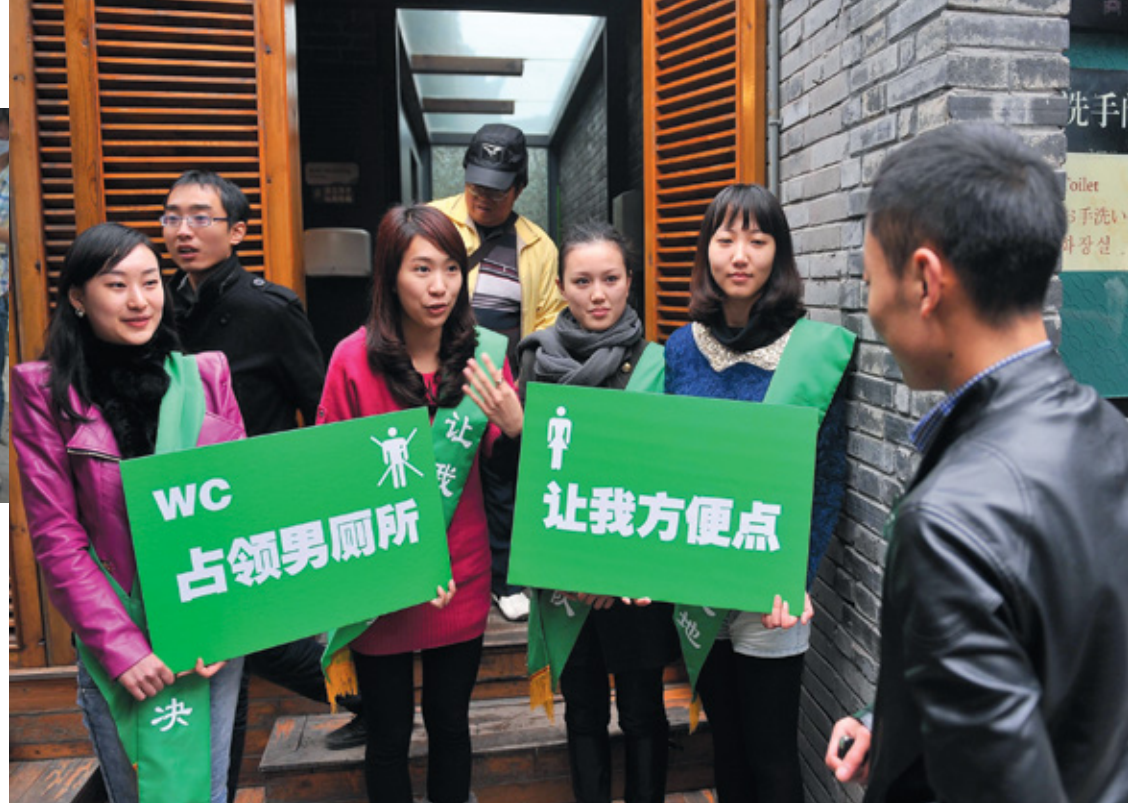
Women protesters outside a men's restroom.