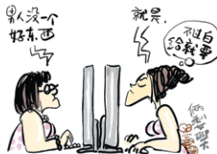
Two young women at an Internet cafe: 'There are no decent men out there.' The other replies: 'I will take one if he comes free of charge.' Cartoon in response to campaign against 'leftover women' of the Women's Federation.

in their early careers. And this is related as well to the one-child policy. A lot of scholars have done research showing that as a result of the one-child policy, parents with only one daughter tend to invest a lot in her education, because the daughter does not need to compete with a brother for parental investment. But what you are not seeing is that increased education translating into economic gains when women enter the workforce and particularly when they get married.