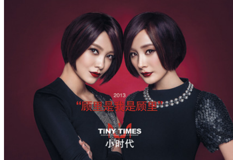
Film poster of Tiny Times , directed and produced by Guo Jingming.

But the era of the microblog that started with the launch of Sina Weibo in 2009 is also one that seems to celebrate brashness and materialism, and the subservience and sexualisation of women over the sort of qualities that have brought the likes of Hu Shuli, Dai Qing and other such women to prominence. Although there are still inde-