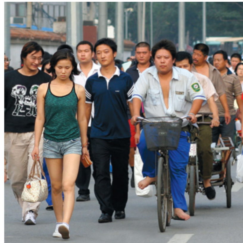
Street scene in Zhuzhou, Hunan province.

I personally think that you may lose face by marrying an old man, but at least you might have some security in life. He might also be less flirtatious. A more stable life would bring you a sense of safety.