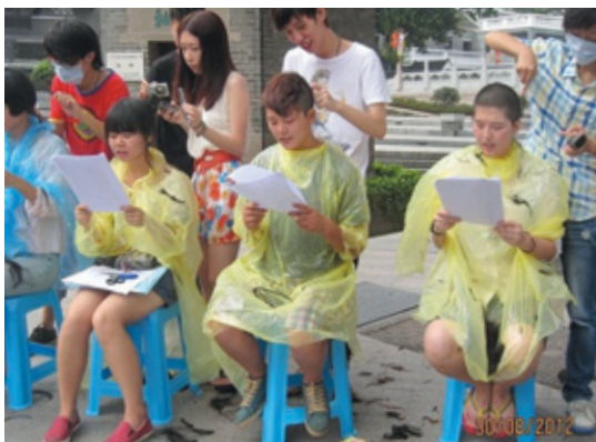
Women shave their heads to protest gender biased examination policy.