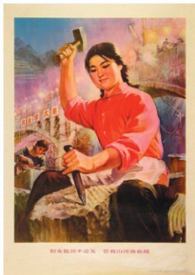
'Women hold up half the sky, manage the landscape to give it a new face.' Mao-era propaganda poster from Liaoning province, April 1975.

can be heated arguments over whose name is going to be registered on the property deed. Time and time again I have found young women who are unwilling to walk away from an unequal financial arrangement because they are so anxious about not finding another husband, and so I think that this 'leftover women' campaign has also contributed to the creation of the enormous gender wealth gap.