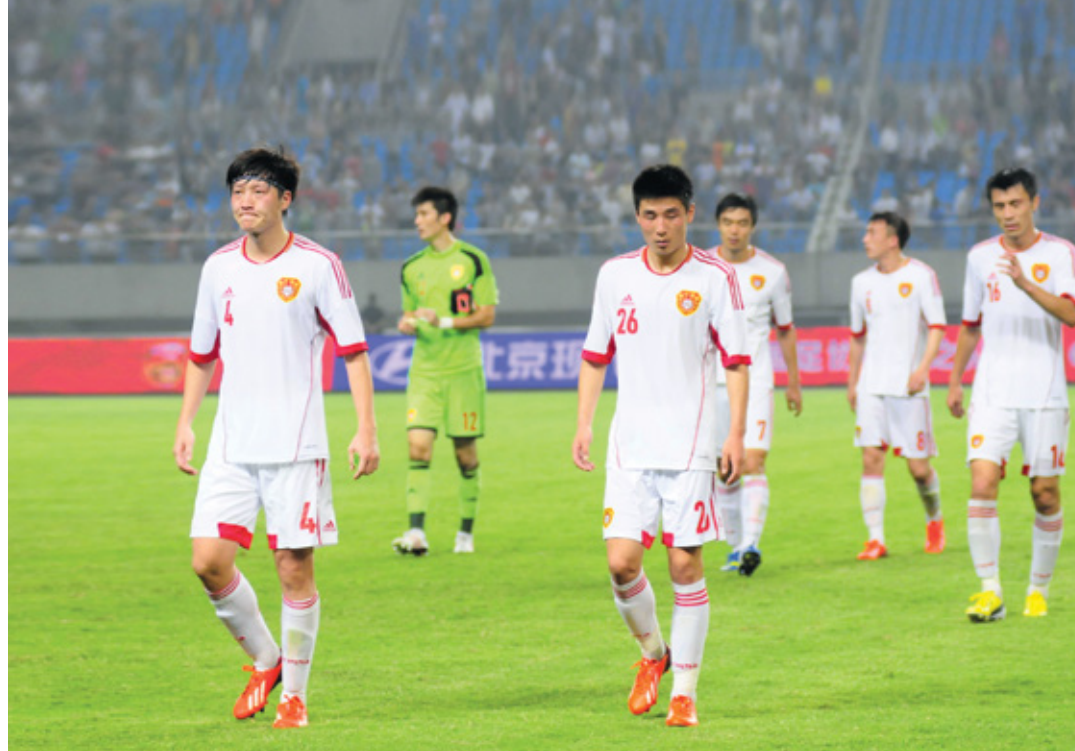
Members of the Chinese national football team walk dejectedly off the field after their 1-5 drubbing by a young Thai team in Hefei, Anhui province, 15 June 2013.

Problems arose with the advent of professional football in China in the 1990s. The first professional national league was set up in 1994, composed of clubs largely run as commercial ventures and with lavish sponsorships from state-owned enterprises. Initially, player salaries were low, but they began to rise as the clubs, buffered by a state-funded safety net, took on more debt. By 1998, the average attendance per game hovered at around 20,000.