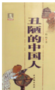
Cover of a recent edition of The Ugly Chinaman , first published in 1985.

in the People's Republic and has gone through numerous reprints. Such critiques of the Chinese national character, frequent from the late nineteenth century, have become something of a cottage industry in recent decades.