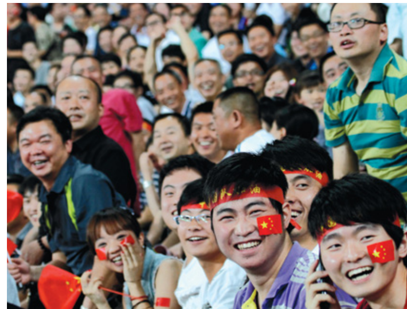
Chinese football fans in Guiyang, Guizhou province, when their national team beat North Korea, June 2011.