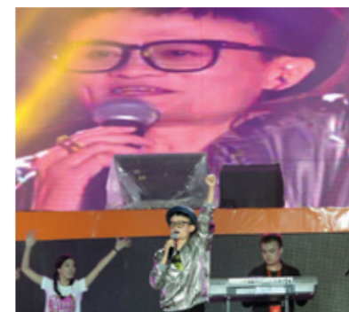
Jack Ma, founder of Alibaba, on stage.

Chairman of Baidu, a China-based Internet search engine. Li shifted Baidu's focus to cloud computing this year.