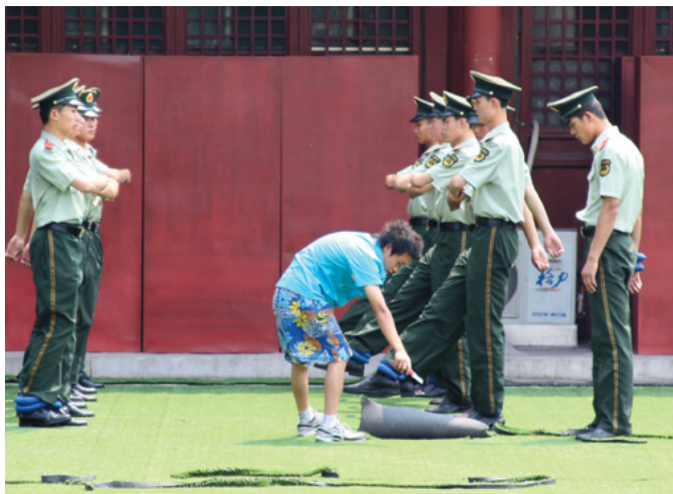
Spotting imperfections.

Concepts such as democracy, freedom, equality, rule of law, justice, integrity, and harmony should be incorporated into core socialist values ... . These concepts have never been merely patents of the bourgeoisie, but are the product of the civilising process which is commonly created by all human beings. These concepts symbolise both the moral values of humanism which are embedded in the rule of law, and the fundamental conditions upon which the rule of law is conceived. ... [T]he inclusion of these concepts into core socialist values will not only enrich the core socialist values system, but will also endow socialist values with a commonality and compatibility with other value systems.