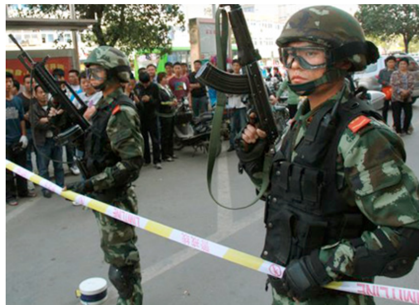
The portrayal of crackdowns on crime encourage the public to appreciate the benefits of a strong and protective state.

The rhetoric of the 'rule of law' has not by any means supplanted the language of mass-line justice that has been a staple of justice administration since the mid-2000s. Now more than ever, the Party is keen to be seen as responsive to the needs of the masses. This is reflected in law and order rhetoric. For instance, just days before he left for his American tour in June 2013, Xi Jinping spoke at a national conference organised by the Central Party's Politico-Legal Commission. He highlighted the need to allow the 'people's demands for the administration of justice' ( renminde sifa yaoqiu 人民的司法要求), along with the requirements of economic development, to be the guiding force of police work in China. Gone, for now at least, is Zhou Yongkang-style 'rigid Stability Maintenance'. But the commitment to stability remains: the NPC announced in March 2013 that the budget for 'stability maintenance' would increase by 8.7 percent over 2012 to RMB761.1 billion (US$123.7 billion).