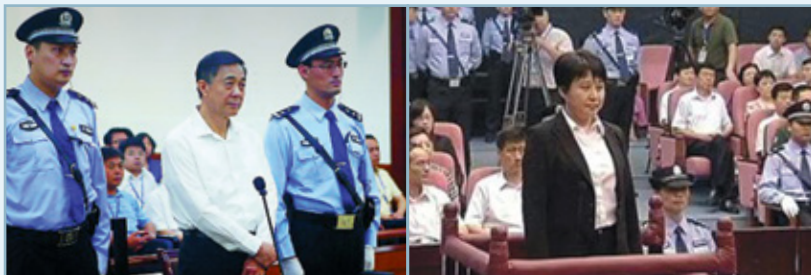
Bo Xilai on trial.