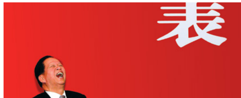
Xiao Yang in Southern Weekly on 6 July 2012.

As it has been noted in the introduction to this Yearbook , lively discussions around the rule of law, constitutionalism and judicial independence dictated the agendas and inspired discussions in the liberal press and scholarly circles in December 2012 and January 2013. Liberal intellectuals and activists increasingly used the expression 'constitutional governance' ( xianzheng 宪政) to demand the realisation of the basic rights guaranteed by the Constitution. But Communist Party rhetoric about building rule of law — including a call by Xi Jinping in December 2012 to fully implement the authority of the Constitution — revealed the senior leadership had a far more limited agenda.