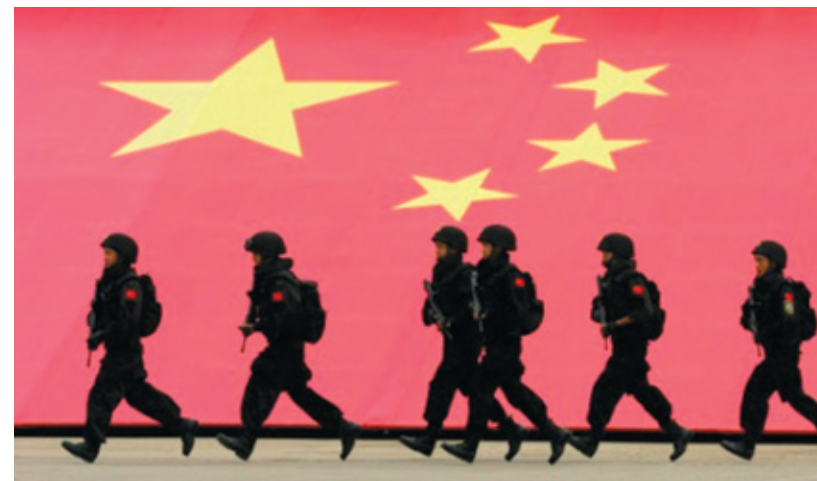
Special police force on the move.

The law–politics nexus in China is well illustrated by the major political events of 2012–2013. This period’s justice-related highlights and lowlights include the dramatic downfall of the Bo Xilai empire in Chongqing, his wife’s murder trial in August 2012 and the associated criminal trial of his right-hand (police-) man Wang Lijun in September 2012. They include other high-profile trials such as that of millionaire businesswoman Wu Ying, who escaped execution apparently as the result of nationwide public demands for leniency, and that of Burmese drug lord Naw Kham, whose final hours before execution March 2013 in Yunnan province were televised nationwide.