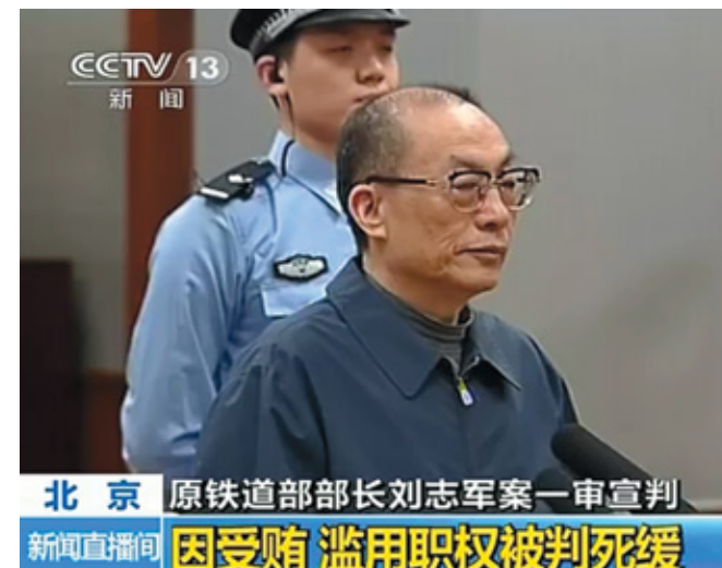
Liu Zhijun, former Railways Minister, at his trial, July 2013.

trict in Chongqing municipality, onto the Internet. This case is but one of many where the dalliances of officials, whose mistresses have often also been implicated in corruption, have been exposed. In April 2013, Liu Zhijun, the former Railways Minister who presided over the vast growth in China's high-speed rail system, was charged with corruption — in 2011, Liu had