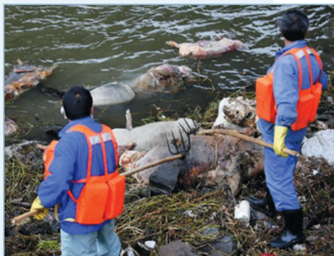
Workers trying to fish floating pig carcasses out of the Huangpu River.

During March 2013, thousands of dead pigs showed up in a stretch of the Huangpu River — a main source of Shanghai's drinking water. Local officials insisted both the water and the city's pork supply were safe. The authorities never explained how the pigs died or how they ended up in the river. Evidence suggested that farmers upstream in neighboring Zhejiang province dumped the dead pigs after officials cracked down on the practice of selling diseased pork to local markets, while making it very expensive to dispose of the diseased carcasses properly.