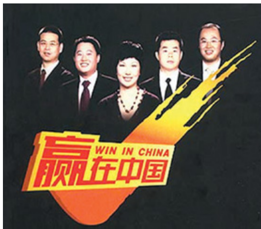
Win in China, China's version of The Apprentice television show.