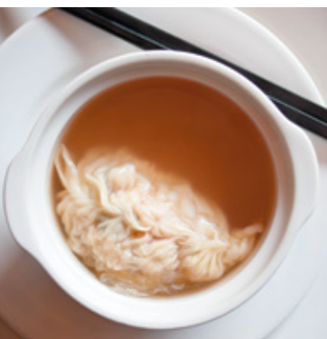
Shark fin soup with shrimp dumplings in Huangpu, Shanghai.

seen a steep decline has been in the purchase of gift cards. In 2011, some 600 billion yuan of cards were sold and the market was growing at between fifteen to eighteen percent annually. New regulations were enacted in May 2011 to prevent, in the words of the State Council, ‘money laundering, illegal cash withdrawal, tax evasion and bribery’. Subsequently, for transactions exceeding 10,000 yuan, the gift card issuer had to register the purchaser’s name and the names of the people who would redeem them. Furthermore, no card could be issued with a value of more than 5,000 yuan and officials were banned from receiving them in the course of their duties.