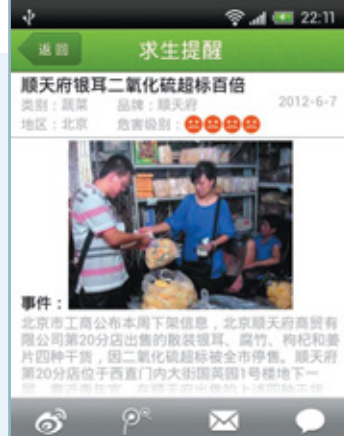
Screenshot of the 'China life-saving manual' app.

In May 2013, the Ministry of Public Security released results of a three-month crackdown on food safety violators, saying that authorities investigated more than 380 cases and arrested 904 suspects. Among those arrested were sixty-three people who allegedly ran an operation in Shanghai and the coastal city of Wuxi that bought fox, mink, rat and other meat that had not been tested for quality and safety, processed it with additives like gelatin and passed it off as lamb. The meat was sold at farmers' markets in Jiangsu province and Shanghai.