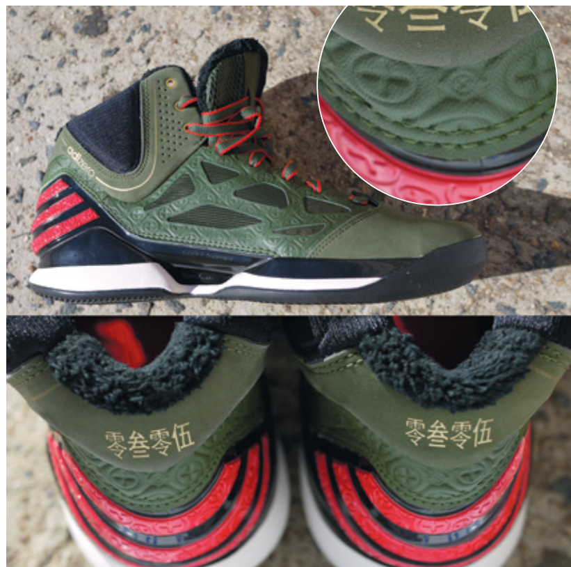
Derrick Rose basketball shoes inspired by Lei Feng. Design features 'revolutionary screws that never rust'.

As the title of the People's Daily guide suggests, exemplars can be both positive and negative. Official historians in imperial times were obliged