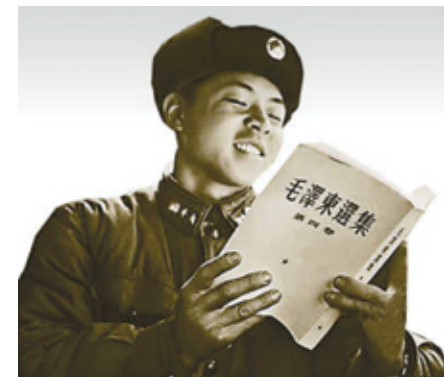
Comrade Lei Feng.

Lei's official biography relates that he was born in 1940 in Hunan province to a rural family and orphaned at seven. His father had been killed by the Japanese and his mother committed suicide after being raped by the son of a powerful landowner. 'Adopted by the Party', as the hagiography puts it, Lei Feng joined the PLA when he was twenty and was transferred to Liaoning province in the northeast. He died in 1962 when he was hit by a telegraph pole that an army truck had knocked over while backing up. In 1963, his diary was 'discovered' — portions had previously appeared in 1959 and 1960 in the Shenyang military region newspaper Progress ( Qianjin bao 前进报) — and published under the sponsorship of Lin Biao, then Minister of Defence. The diary is full of entries describing his acts of selflessness, such as darning the socks of his comrades in the platoon while they slept, and of his devotion to Mao Zedong — he is known as 'Chairman