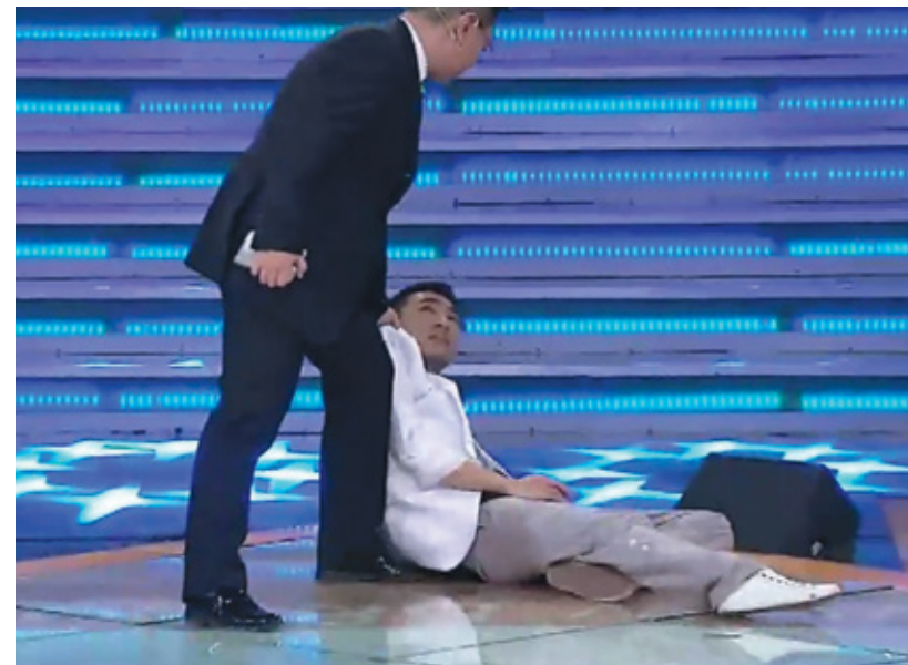
One of the contestants on Only You , a television show based on The Apprentice , collapses under the strain of severe questioning by the judges.

For every Liu Zhijun or Lei Zhengfu gaining financially from their official positions, there were those in business on the other side of the transaction who were also making windfall profits from official corruption. These people are not immune from prosecution. In July 2013, a businessman accused of 'illegally raising 3.4 billion yuan and defrauding tens