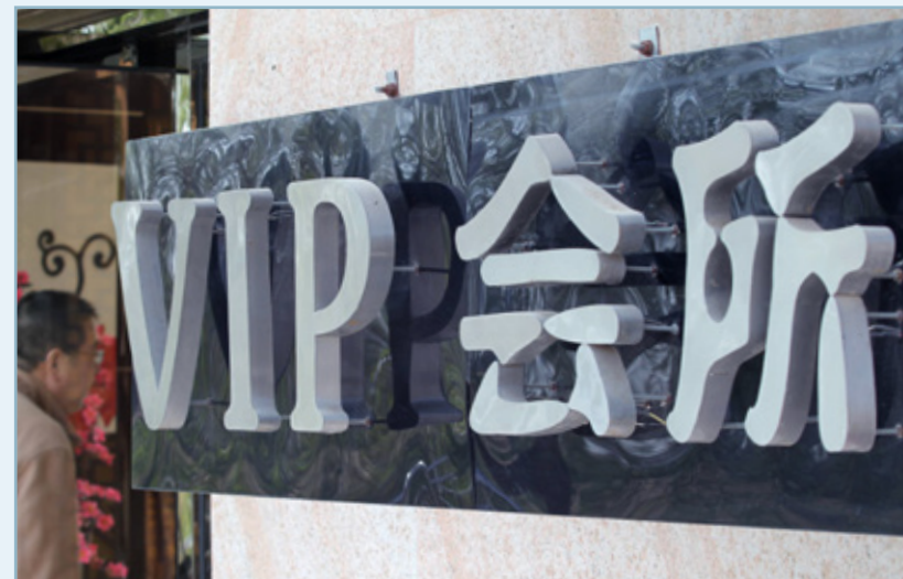
Entrance of a VIP clubhouse. In May 2013, officials and employees working in disciplinary and supervisory departments were ordered to discard all VIP membership cards.

On 22 January 2013, Xi followed up on his November pronouncements with a more pointed declaration of intent. The Party would not just stamp out transgressions among the leadership of the country but it would address infractions of discipline by local officials as well. In what may become one of Xi’s best-known slogans, he asserted that ‘we must fight tigers and flies at the same time’ ( yao jianchi ‘laohu’, ‘cangying’ yiqi da 要坚持‘老虎’、‘苍蝇’一起打). Xi’s targets included the extravagant banquets and other luxury perks that officials have long enjoyed, as well as the kind of petty bureaucratic formalism that includes endless speechifying and elaborate, expensive and self-aggrandising ceremonial events. If the Party failed to address this culture of corruption, he warned, then ‘it will be like putting up a wall between our Party and the people, and we will lose our roots, our lifeblood and our strength’. To prevent corruption occurring in the first place, power should be exercised within what he called ‘a cage of regulations’.