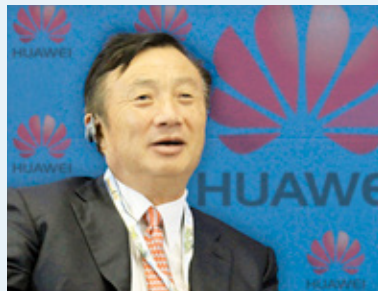
Huawei Chairman Ren Zhengfei.