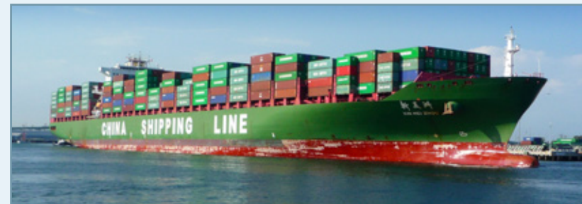
Container ship Xin Mei Zhou of the Shanghai-based China Shipping Line.