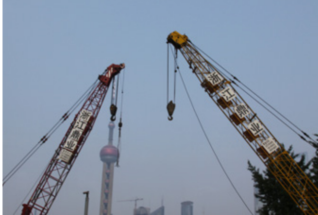
Cranes meet tower.