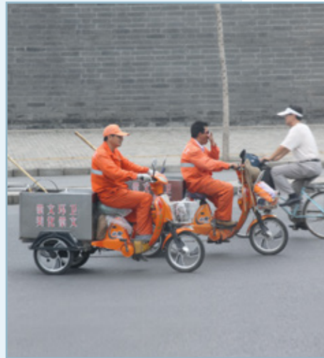
Street cleaners on the move.

Yasheng Huang was one of those critics. In his article 'Democratise or Die: Why China's communists face reform or revolution', Huang debunks many of Li's arguments, arguing that democratisation is the only option for China, and that an increasing number of Chinese elites believe that the status quo is no longer viable. Despite the huge economic and social gains of the past few decades, the system 'has also proven ineffective at creating inclusive growth, reducing income inequality, culling graft, and containing environmental damage. It is now time to give democracy a try.'