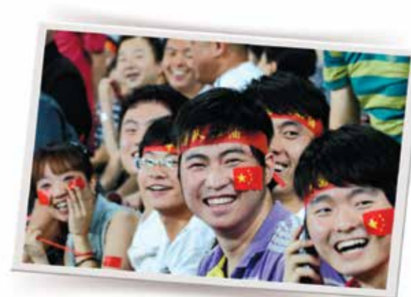
Chinese football fans, Guiyang, June 2011.

As China becomes wealthier and more confident on the global stage, it also expects to be respected and accommodated as a major global force — and as a formidable civilisation. Through a survey and analysis of China's regional posture, urban change, social activism and law, mores, the Internet, history and thought — in which the concept of 'civilising' plays a prominent role — China Story Yearbook 2013 offers insights into the country today and its dreams for the future.