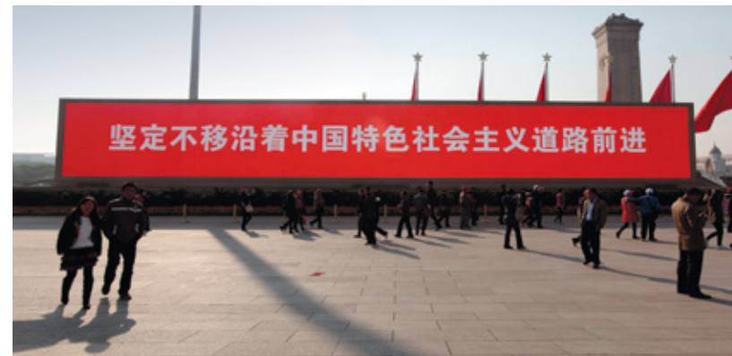
‘Advance Resolutely Along the Way of Socialism with Chinese Characteristics’.

At the Eighteenth National Party Congress in November 2012, outgoing President Hu Jintao stated that ‘the path of Socialism with Chinese Characteristics, the system of theories of Socialism with Chinese Characteristics and the Socialist System with Chinese Characteristics are the fundamental accomplishments of the Party and people in the course of arduous struggle over the past ninety-plus years’. To reiterate (and reiterate, and reiterate) this point, incoming President Xi Jinping used the formula ‘Socialism with Chinese Characteristics’ ( Zhongguo tese shehuizhuyi 中国特色社会主义) seventyfive times in his own address to the Congress.