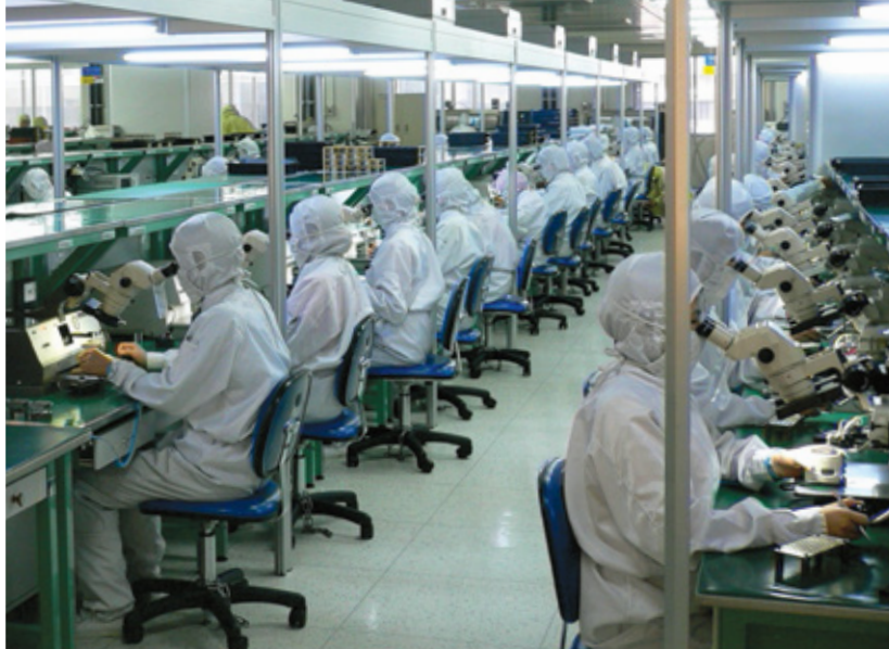
Workers assembling and testing fiber optic systems.