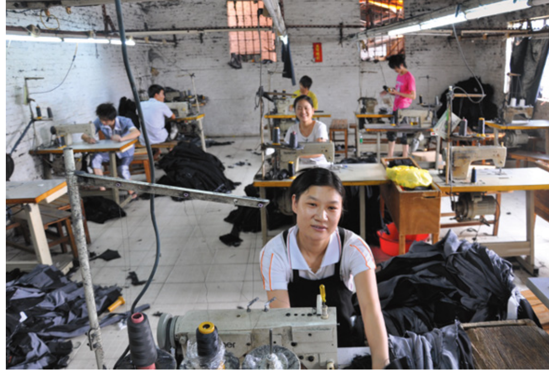
Jeans factory in Shunde, Guangdong province.