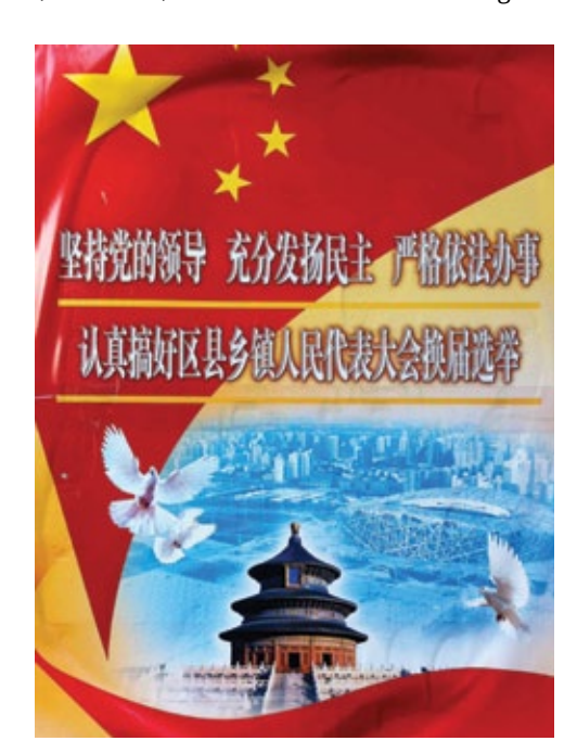
Insist on leadership by the Party, develop democracy to the fullest, do everything according to the law. Diligently carry out elections for representatives at district, county, village and town levels.'

In twenty-first century marketized China, such concepts of social (and overt) class contradictions belong to a different era. Today, the au-