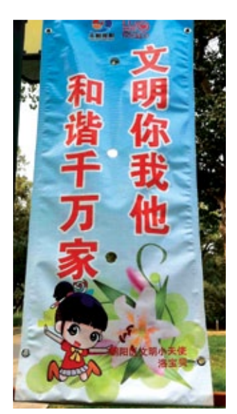
A propaganda poster from the Chaoyang District Government, Beijing: 'If you, me and him are civilized, all families will live in harmony.'

The nationwide social anomie was in part exacerbated by the political transition that was slowly unfolding in the lead up to the 2012-2013 renewal of Party and state leaders in Beijing. Without an open political process, a free media, or regular channels for political contestation in which differing socio-political agendas could be aired, some of the aspirants for the top jobs in China sought to bolster their political capital by demonstrating their ability to maintain 'stability and unity'. This made the landscape of law and justice in China, hitherto dominated by a single, dominant Party ideology, contested territory.