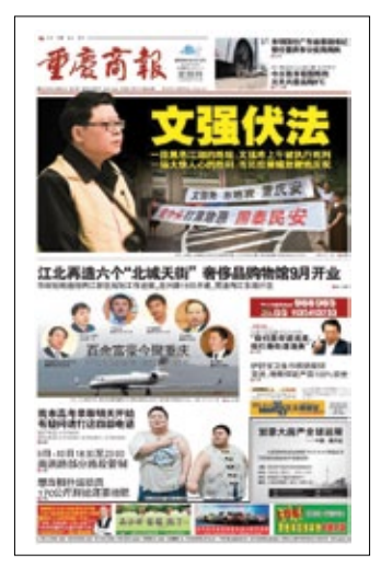
8 July 2010: the execution is announced of Wen Qiang, former head of the Municipal Judicial Bureau of Chongqing, for a number of crimes ranging from protecting organized crime and accepting bribes to rape. His conviction came as a result of the 'Strike Black' campaign.

By 2010, Bo Xilai's 'Chongging Model' was for driving the conversation on issues of justice and policing, on the Internet, in communities and in the capital Beijing itself. He boldly coloured his socio-economic and justice policies red, justifying his approach as being one that 'puts the people first' (an update of the old Maoist slogan about 'serving the people'). He also claimed that it a 'necessary corrective' to the political and economic approach laid down by Deng Xiaoping during his 1992 Tour of the South that 'development is an inescapable necessity' (fazhan shi ying daoli 发展是硬道理). In its place, Bo attempted to situate 'the people' at the centre of socio-economic policy and he proposed to do so by improving the living and working conditions of Chongging's