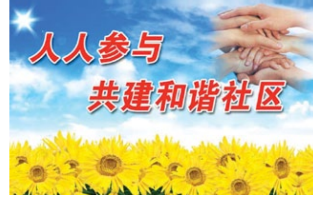
Propaganda poster: 'Everybody participate; collectively build an harmonious community.'

Two contrasting approaches shaped the legal landscape during the post-Beijing Olympic years, 2008-2012. The first was the 'Chongqing initiative' or model that pursued a two-pronged policy summed up in the slogan 'Sing Red, Strike Black'. The charis-