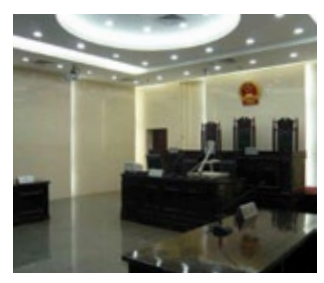
A courtroom, Supreme People's Court, Beijing. The court boasts 340 judges.