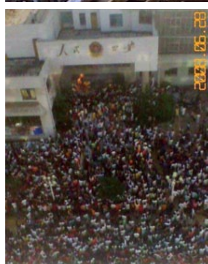
Demonstrations in Weng'an, Guizhou province, after allegations of a cover-up connected with a girl's rape and murder turned violent.

(chengshi guanli xingzheng zhifa renyuan 城市管理行政执法人员, chengguan for short; a particularly unpopular form of roadside bureaucrat) tipped over a tricycle cart being ridden by a sixty-year-old female peddler, resulting in her death. Hundreds of witnesses to the accident surrounded the government vehicle and beat up the officers.