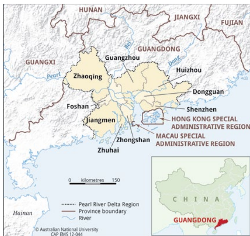
Map 1: Guangzhou, Guangdong Province

Two cities were at the forefront of debates over national directions in social and economic development in China during 2010-2012: Chongqing in west China and Guangzhou on the south coast. Both cities are centres of massive conurbations and urbanizing regions – large and growing metropolitan areas comprising groups of cities with complex governments and diversified economies that serve major planning and development goals. Guangzhou is the provincial capital of Guangdong province and the regional capital of the Pearl River Delta region, which led China's opening to the world economy in the 1980s based on export manufacturing and