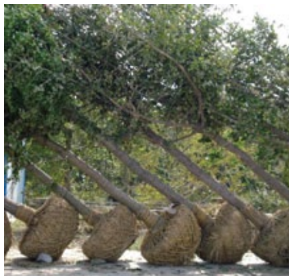
Ginkgo saplings ready for transplanting.

Empowered to develop the city in the national interest, Bo Xilai promoted highly visible urban policies such as the mass planting of ginkgos, an apt symbol for what in this volume we call 'red rising'. His unprecedented flair for using the media to boost Chongqing and his agenda led to regular coverage about his leadership in the national and international press and helped fuel the idea of a 'Chongqing Model' that was unique to the city and with relevance for the rest of the country. Other campaigns drew on the 'red practices' of the Maoist era, including the 'Sing Red' campaign of staging mass songfests in work places and public parks. The highly publicised crack-down on corruption and organised crime during 2009-2010, the so-called 'Strike Black' campaign, meanwhile resulted in the restructuring of police