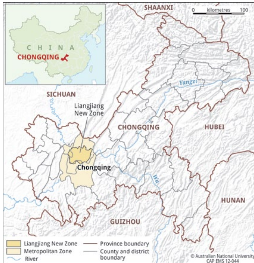
Map 2: Chongqing

ern Media Group, has a national reputation for quality reporting and investigative journalism. In contrast, Chongqing represents an entirely different set of characteristics that relate to the history of Sichuan province, from which it was administratively severed to become a provincial-level municipality (like Beijing and Shanghai) in 1997. Like Chengdu, the provincial capital of Sichuan province, Chongqing is part of the Chinese heartland and a major center of Mao-era defence industries. During 2010-