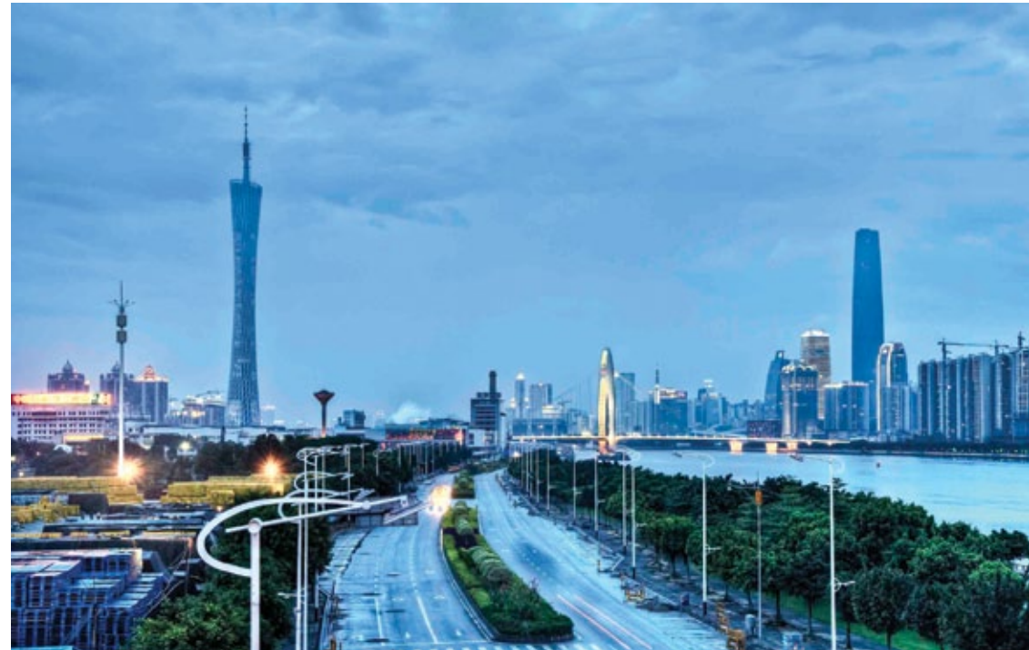
Guangzhou city centre as viewed from Hua'nán bridge.

In February 2012, the Chongqing chief of public security Wang Lijun, who had previously led the 'Strike Black' anti-crime campaign, turned up at the US Consulate in Chengdu for a highly unusual visit. Wang ultimately left the consulate 'on his own volition'. He was ushered off to the capital to undergo what the official media initially described as 'vacation-style therapy' on grounds that he had suffered some kind of nervous collapse brought on by overwork. The spectacle of the