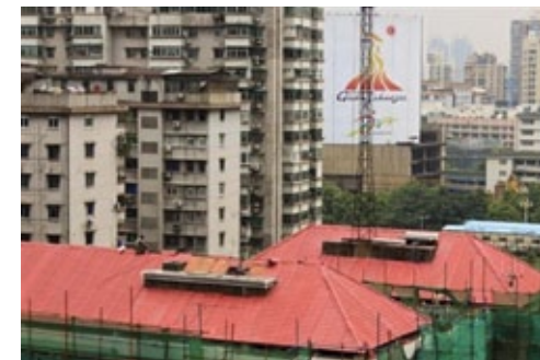
In the summer of 2010, the Guangzhou municipal government augmented the flat roofs of old apartment buildings with PVC boards so that passers-by would be given the illusion that they were sloped, red-tiled roofs.

Today, the Pearl River Delta contains nine major cities, all of which have little in common with the riverine rural society of the past. The cities of Guangzhou and Shenzhen are among the wealthiest in the country and nearby Dongguan and Foshan are rapidly becoming key provincial manufacturing centres. To urban planners the integration of these cities seems