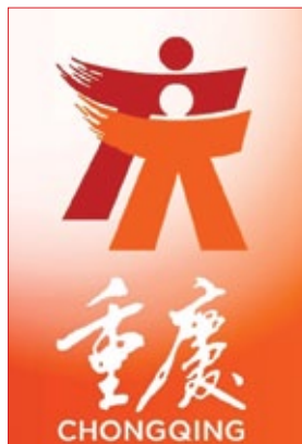
A city logo promoted on Chongqing municipal government websites during Bo Xilai's rule.

In central China, summer continental air masses make Chongqing one of China's 'furnaces' or 'oven cities' and great banyans ( Ficus laevis ) have for years been the city's most common shade tree. In 1986,