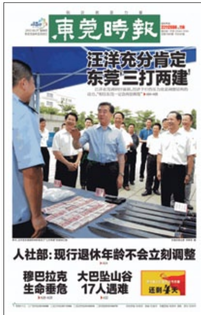
Front page of The Dongguan Times featuring Guangdong Provincial Party Secretary Wang Yang.

Administrative regions. The proposed integration of the former British and Portuguese colonies into mainland China's communications and transport networks are particularly controversial in Hong Kong. Local activists and others are wary of seeing Hong Kong incorporated into a vast national project. Shortly after moving from his earlier administrative position in Chongqing, the present Guangdong provincial Party Secretary, Wang Yang, suggested that Guangdong should become China's 'shop' while the hinterland could be the country's 'factory'; Guangdong would to all intents and purposes usurp the role of Hong Kong. Transportation is the key