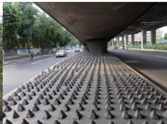
Concrete spikes installed underneath freeway bridges in the city of Guangzhou, apparently intended to deter homeless people from taking up residence.

services. Police and traffic control platforms were put up all over the city and thousands of extra police officers were deployed on the streets. Local citizens praised the moves for increasing their sense of safety, while the crackdown on organised crime led to over 3,000 arrests and convictions of high-ranking officials.