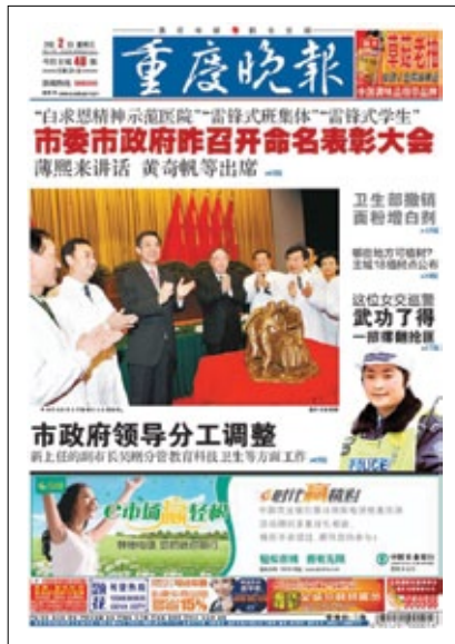
On 2 March 2012, The Chongqing Evening News published a front-page story about a speech Bo Xilai gave to a group of doctors on the 'spirit of communism'. Bo reportedly spoke about the PLA martyr Lei Feng, and also reeled off by heart passages from 'In Memory of Norman Bethune', a famous essay by Mao Zedong.

During his previous tenure as Mayor of the northeastern city of Dalian, Bo Xilai remodeled the city's landscape in a process that included an ambitious greening program of the business district. As a result, the environment of the city garnered international attention for its improvement. For the Communist Party the modern appearance of Chinese cities is an indicator of successful urban management, and Bo's high marks for the transformation of Dalian prompted his appointment as Party Secretary of Chongqing, the new city of west China, to which he took his strategy of creating an urban landscape aimed to impress – 'investors look at a city and judge it by how it looks', he declared. He undertook