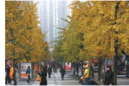
Ginkgo trees on the streets of Chongqing.

This included literal singing, including mass choral renditions of popular Maoist-era patriotic and political songs, as well as the study of 'red classics' (films, books and stories about the country's revolutionary past). 'Strike Black' referred to a far-reaching police campaign aimed at tackling the city's notorious organised crime.