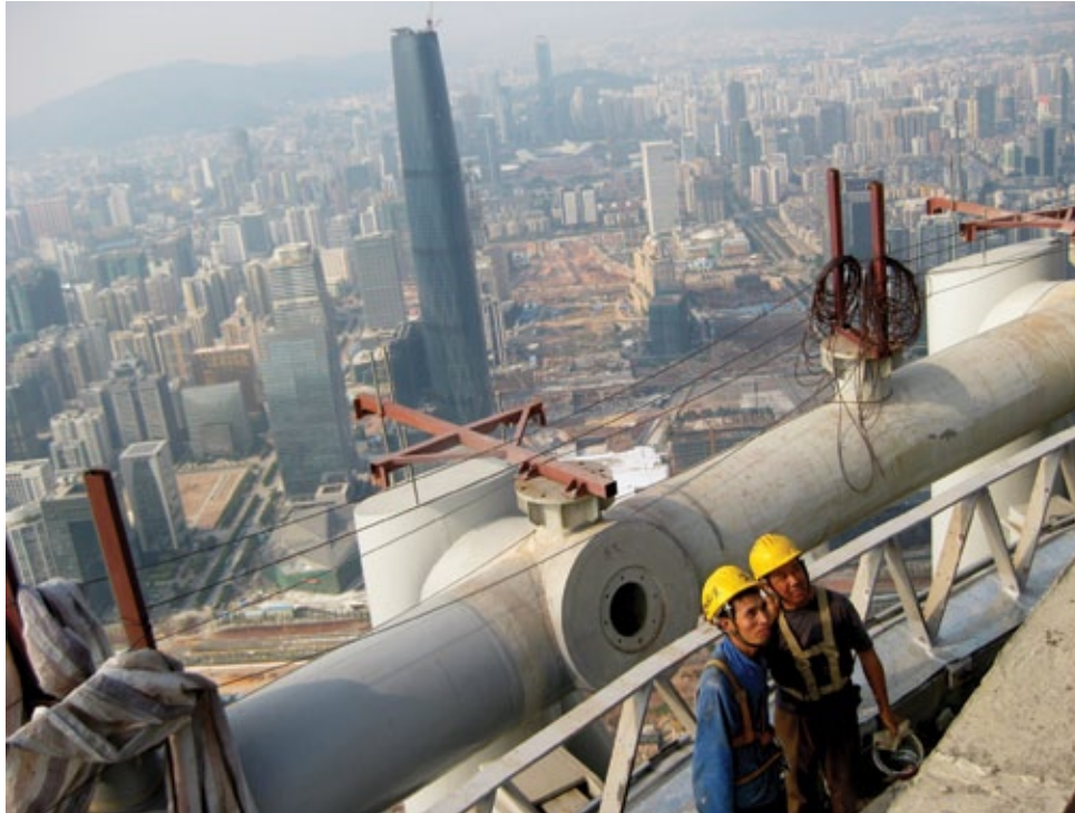
Guangzhou's new central business district.

like an ideal way to increase efficiencies and boost the regional economy. Since the 1980s, economic growth has relied on rapid urbanization; both local and national planners envisage the whole area becoming one vast conurbation: a mega-city of forty-plus million people. There have been modest attempts to integrate service networks in healthcare, transportation and communication across the disparate metropolitan areas; for the most part they remain concentrated in the cities. Large areas of the region remain at least administratively rural.